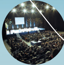
Technical sessions and workshops