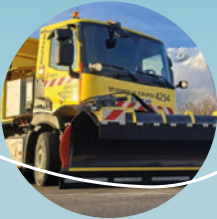
World Snowplow Championship