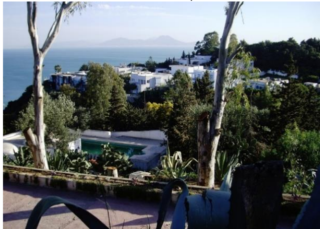
Sidi Bou Said