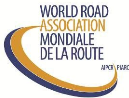
World Road Association PIARC